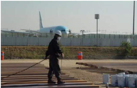
Sheet piles have to be arranged level.

Achieving water tightness of a sheet pile wall can be challenging, given the site conditions, difficulty in sealant applications, high interlock temperatures during driving and other factors. ESC has addressed these issues through its design and extensive experience and is willing to deliver both standard and tailored solutions to project requirements. Here is a full guide on the application and best practices for obtaining a water-tight interlock: