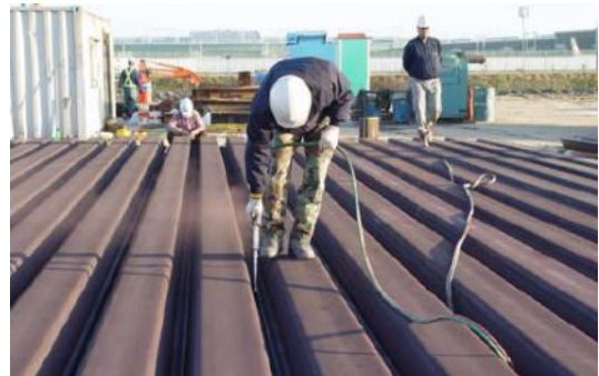
Remove the dust or rust in the interlocks using an