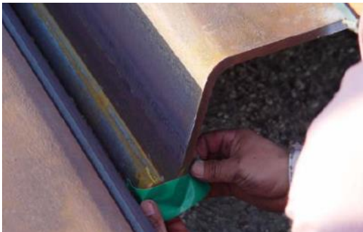
Attach small tape to the both sides to prevent the